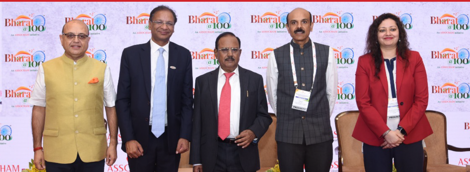
Ajit Doval, KC, National Security Advisor, Prime Minister's Office at the Netaji Subhas Chandra Bose Memorial Lecture