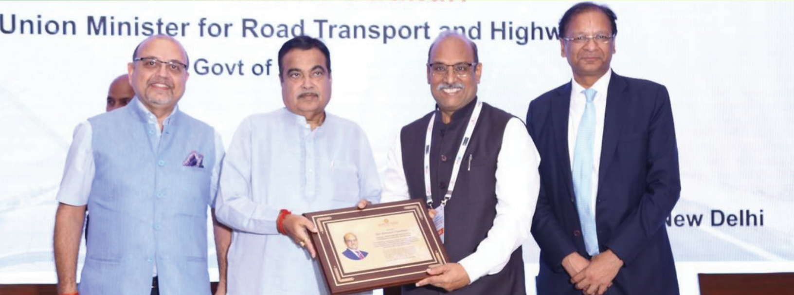
Nitin Gadkari Hon'ble Union Minister of Road, Transport and Highways at ASSOCHAM Annual Flagship Infrastructure Conference cum Awards