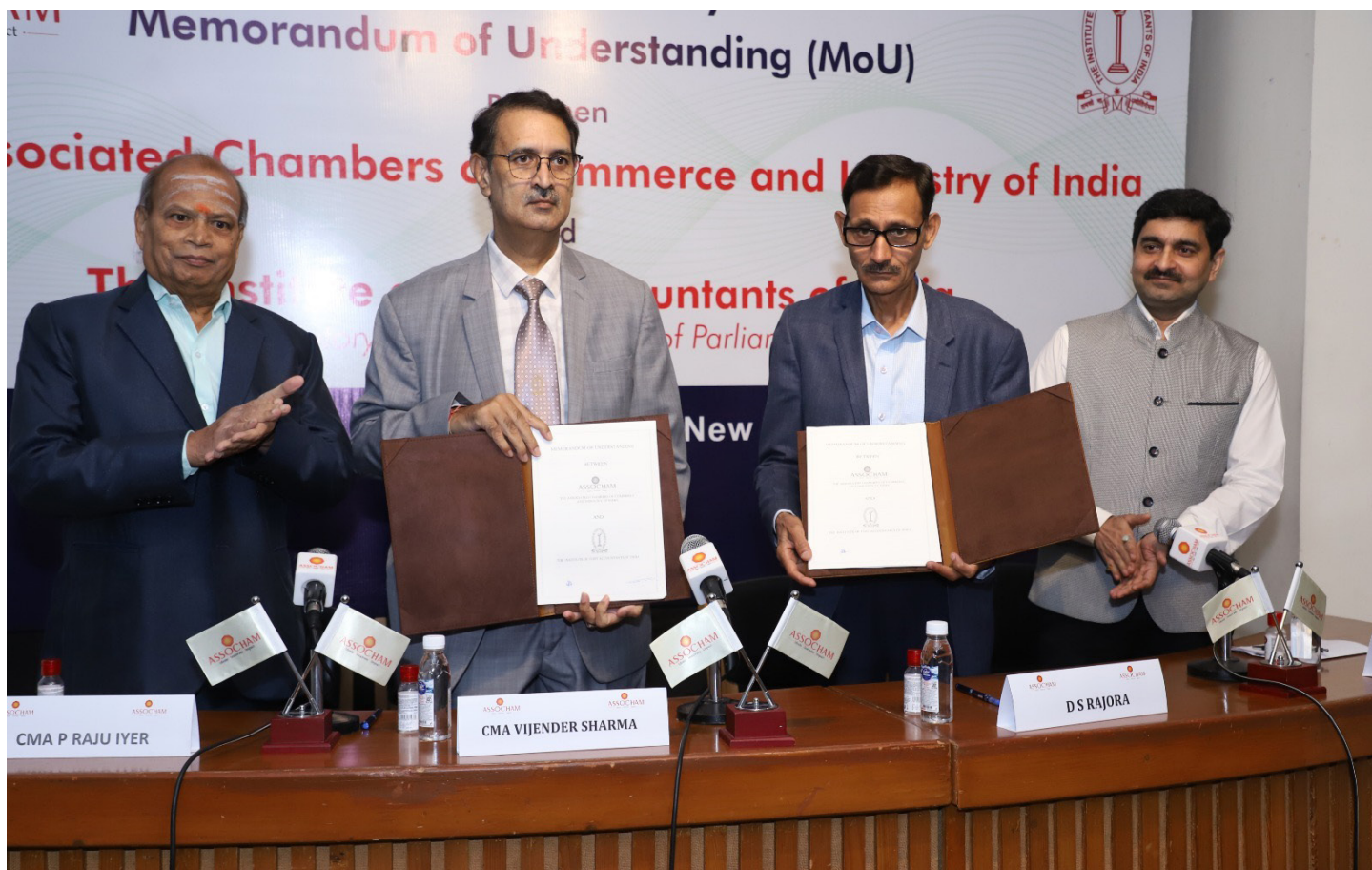
ASSOCHAM and ICAI Collaborate to Combat Money Laundering and Enhance Stakeholder Capacity

is handled amicably. Contract should be drafted in a very concise manner with layman's language with minimum liability, understanding of business plays a critical role in drafting the contract.