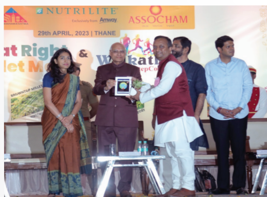
Eat Right Millets Mela