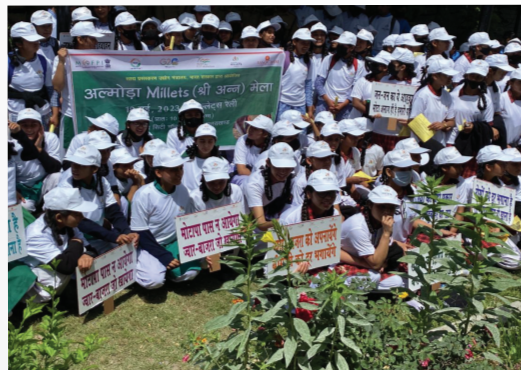
Almora Millets Mela