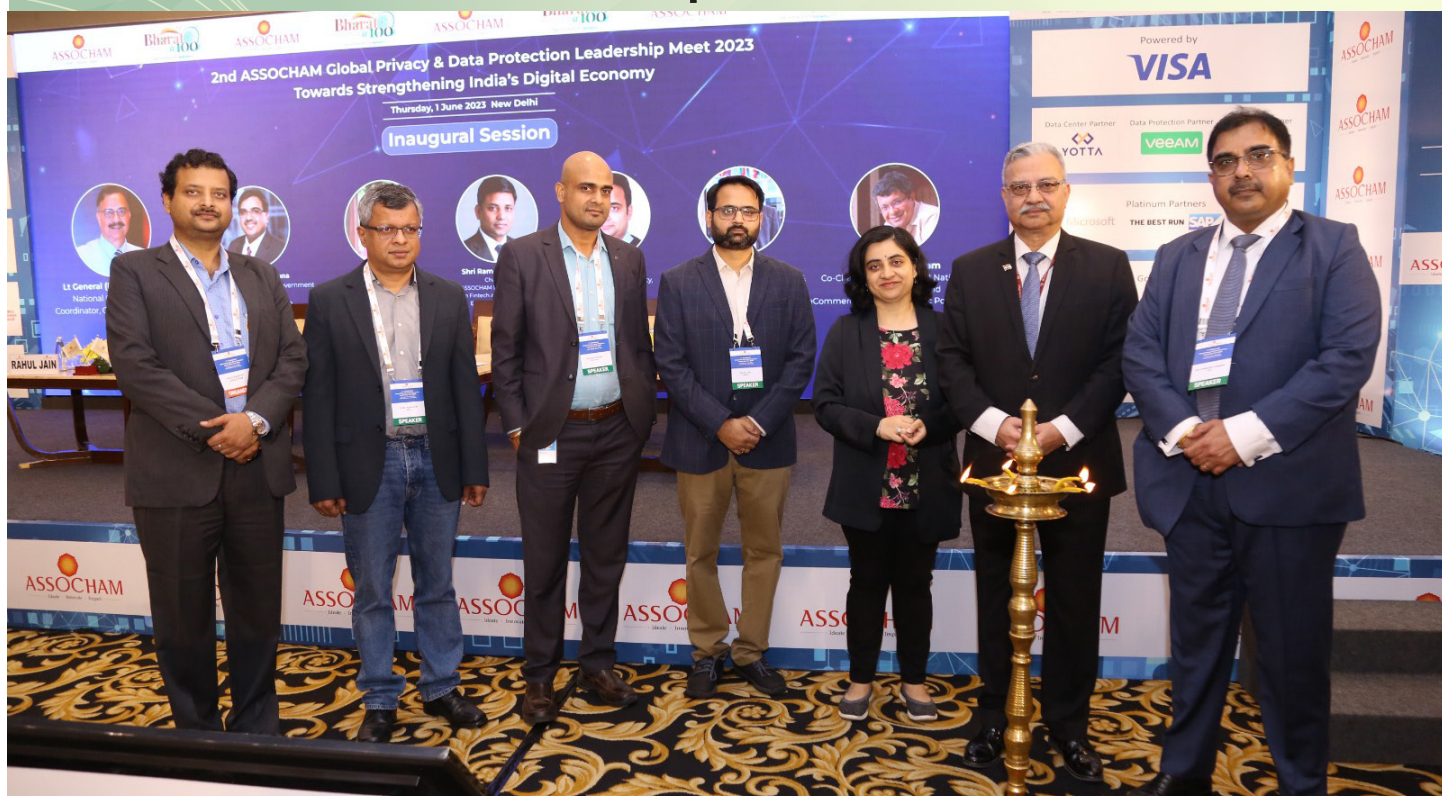
Glimpse of Lamp lighting ceremony at 2 nd Global Privacy & Data-Protection Leadership Meet

Time has come for all of us to understand the nuances of data protection. The government of India is working on 3 major bills namely the Digital India Act which will supersede IT Act 2000 as amended in 2008, The Personal Data Protection bill which is long due will now be tabled in the monsoon session of the parliament and the Telecom bill which will supersede the Telegraph Act, 1885. As a nation we should start thinking about the importance of data which is also called the new oil or a treasure but it is only after you open the box that