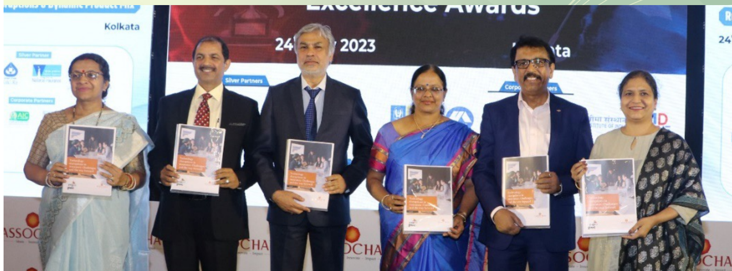
A report on “Technology disruptions in Insurance: Challenges and the Way Forward” was released by the dignitaries.

A SSOCHAM Eastern Region organized Insurance Leaders Meet 2023 at Kolkata on 24th May, 2023. The event was held with the focus on regulations and dynamic product mix for companies to be future-ready. It focused on regulations from IRDA, Government Policies, Global Entrants impacting the Insurance industry of India and its essentials Insurance leaders / Board members foresee future risks and opportunities.