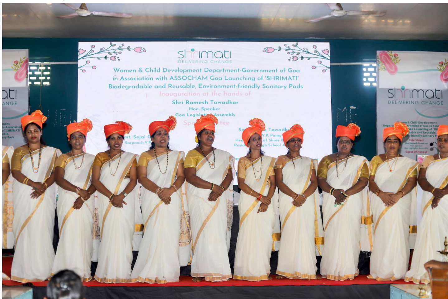
ASSOCHAM Goa Development Council with women and child development department, Govt of Goa celebrated World Menstrual Day 2023

hands of the Hon'ble speaker of Goa legislative Assembly and the MLA of Canacona constituency Shri. Ramesh Tawadkar. The program started with a welcome song offered by the Anganwadi workers of the village. A skit play was also performed to showcase the need of health and hygiene during menstrual cycle. During the technical session, Smt. Deepali Naik, Director women & child development department, Govt of Goa in her address deliberated on maintaining health and hygiene and