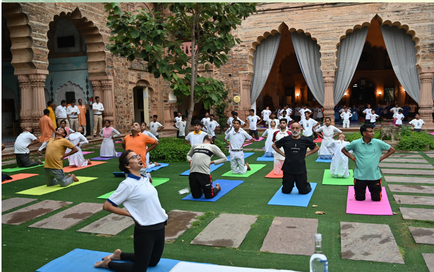
ASSOCHAM and Ministry of Ayush hosted 9 th International Day of Yoga Celebration at Neemrana's Tijara Fort Palace in Alwar, Rajasthan

The Associated Chambers of Commerce and Industry (ASSOCHAM), a leading industry body of the country, on the occasion of International Day of Yoga, Ministry of AYUSH in association with Morarji Desai National Institute of Yoga (MDNIY) organized the 9th International Yoga Day Festival at Tijara Fort Palace, Alwar, Rajasthan. International Yoga Day is celebrated every year on 21st June all over the world. Participating in International