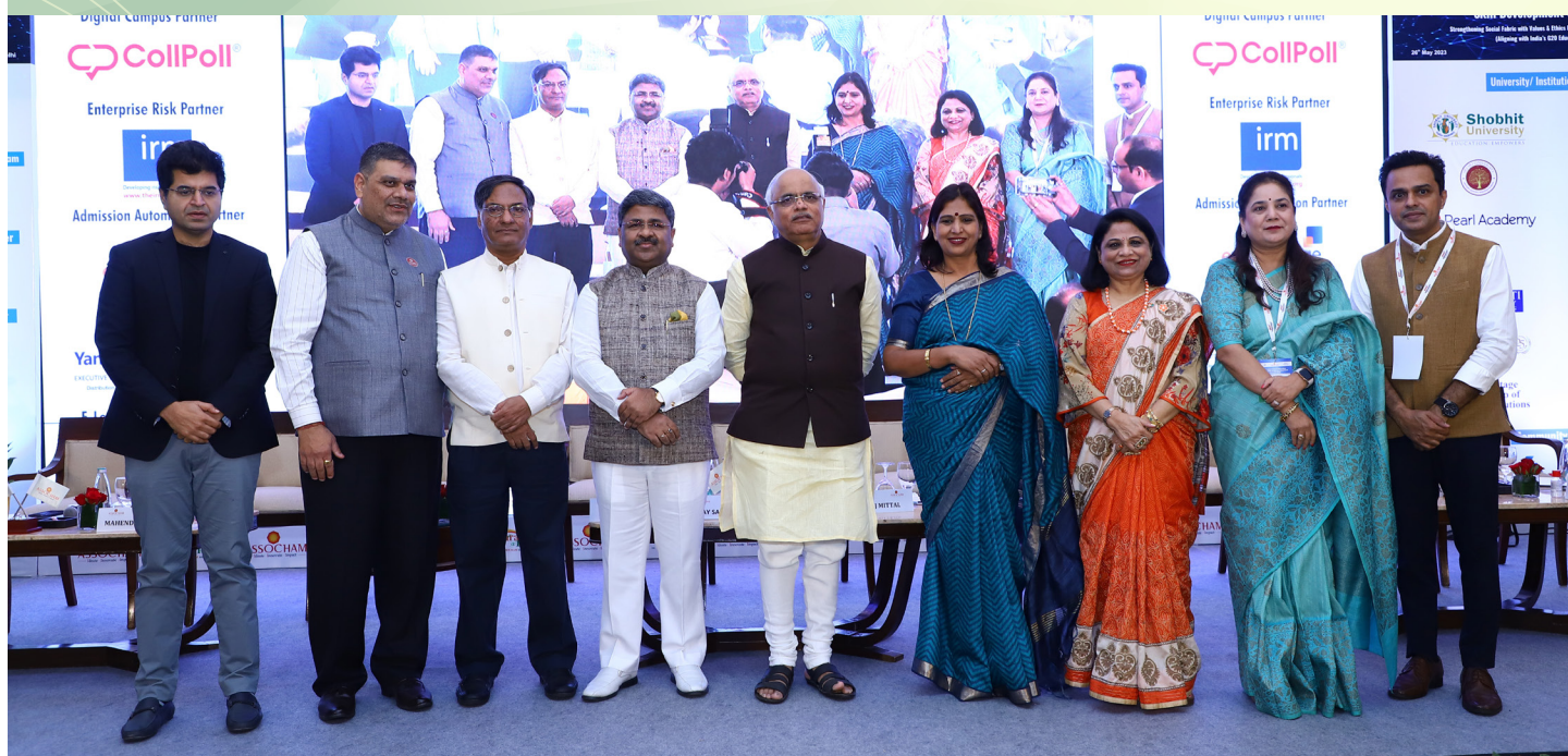
Inaugural address panelists at the 16 th International Education Leadership & Skill Development Summit 2023

problems, gives them a channel for communication and relationship development, and teaches them accountability. It also helps them develop their communication and cooperation abilities with others.