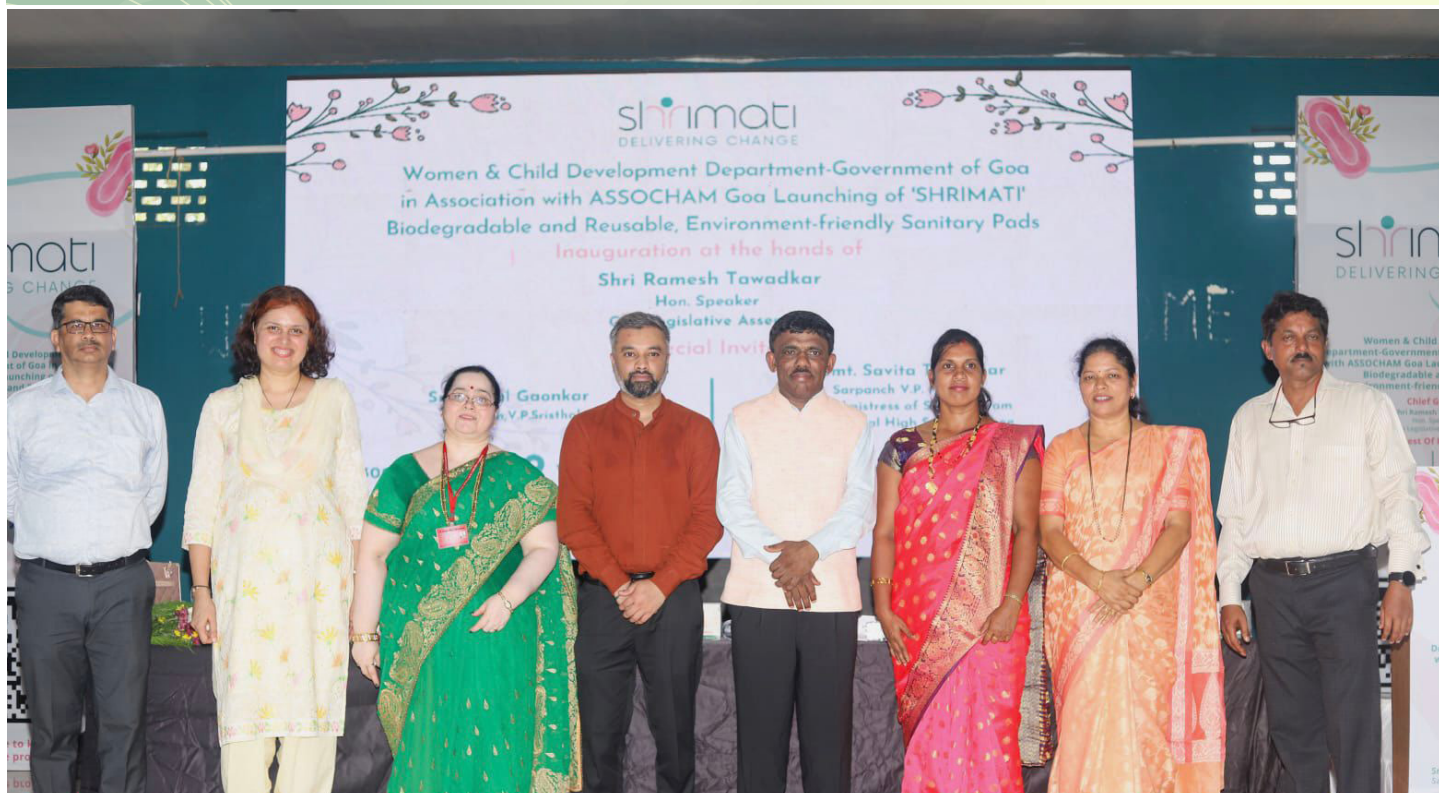
Ramesh Tawadkar, Hon'ble speaker of the legislative assembly of Goa and the MLA of Canacona constituency was invited as the chief guest.

The ASSOCHAM (The Associated Chambers of Commerce & Industry of India) Goa Development Council in association with women and child development department, Govt of Goa supported to organize program on 30th May 2023, and launch of Shrimati sanitary pads, to commemorate Menstrual Hygiene Day. This program was also supported by the Axzora pvt ltd company and EthernetXpress private which enabled the tribal women with distribution of free biodegradable, economical and