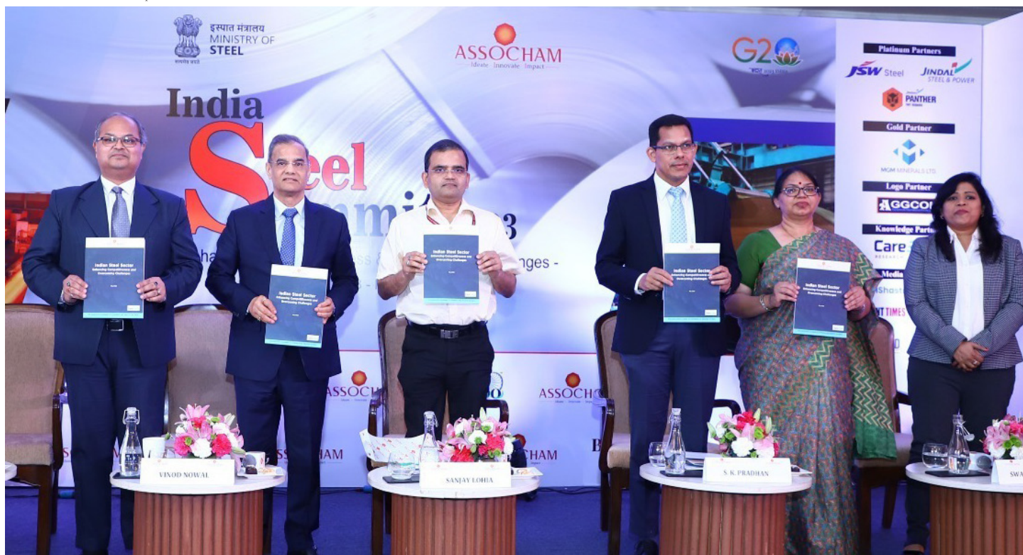
Knowledge report release by ASSOCHAM and Care Edge at the India Steel Summit 2023