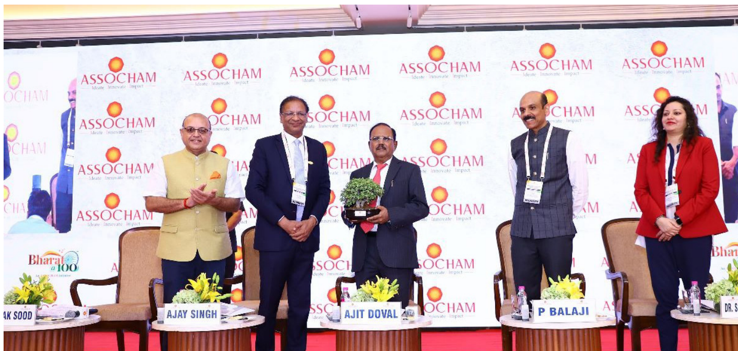
Ajit Doval, KC, National Security Advisor, Prime Minister's Office was welcomed by ASSOCHAM leadership and delegation.

Recognising the remarkable achievements of Netaji Subhas Chandra Bose, Shri Ajit Doval applauded his audacity and tenacity. He highlighted how Bose fearlessly challenged the British authorities, from confronting a British principal during his college days to resigning from the Indian National Congress at a young age, defying even Mahatma Gandhi. Shri Ajit Doval remarked, "Bose possessed audacity like no other. He had the courage to challenge the prevailing powers, regardless of the consequences. His audacity was evident throughout his life, from his journey to London for the ICS to his escape from India during detention. He displayed unparalleled