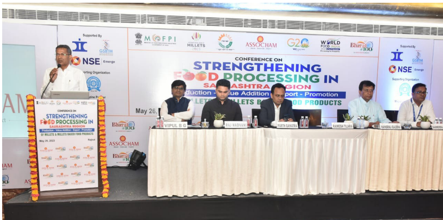
MOFPI and ASSOCHAM organized a conference on Strengthening Food Processing in Saurashtra Region