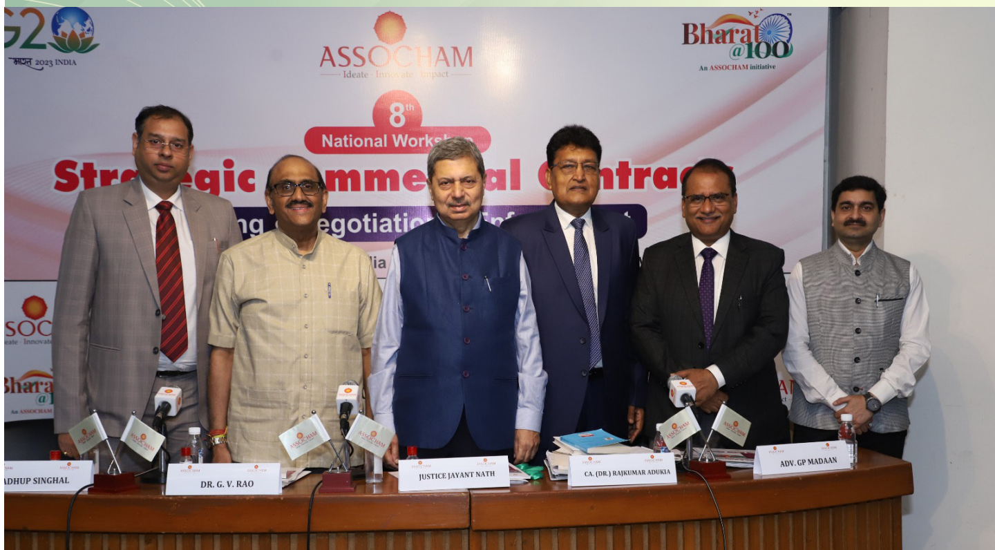
Inaugural session at the 8th National Workshop of Strategic Commercial Contracts