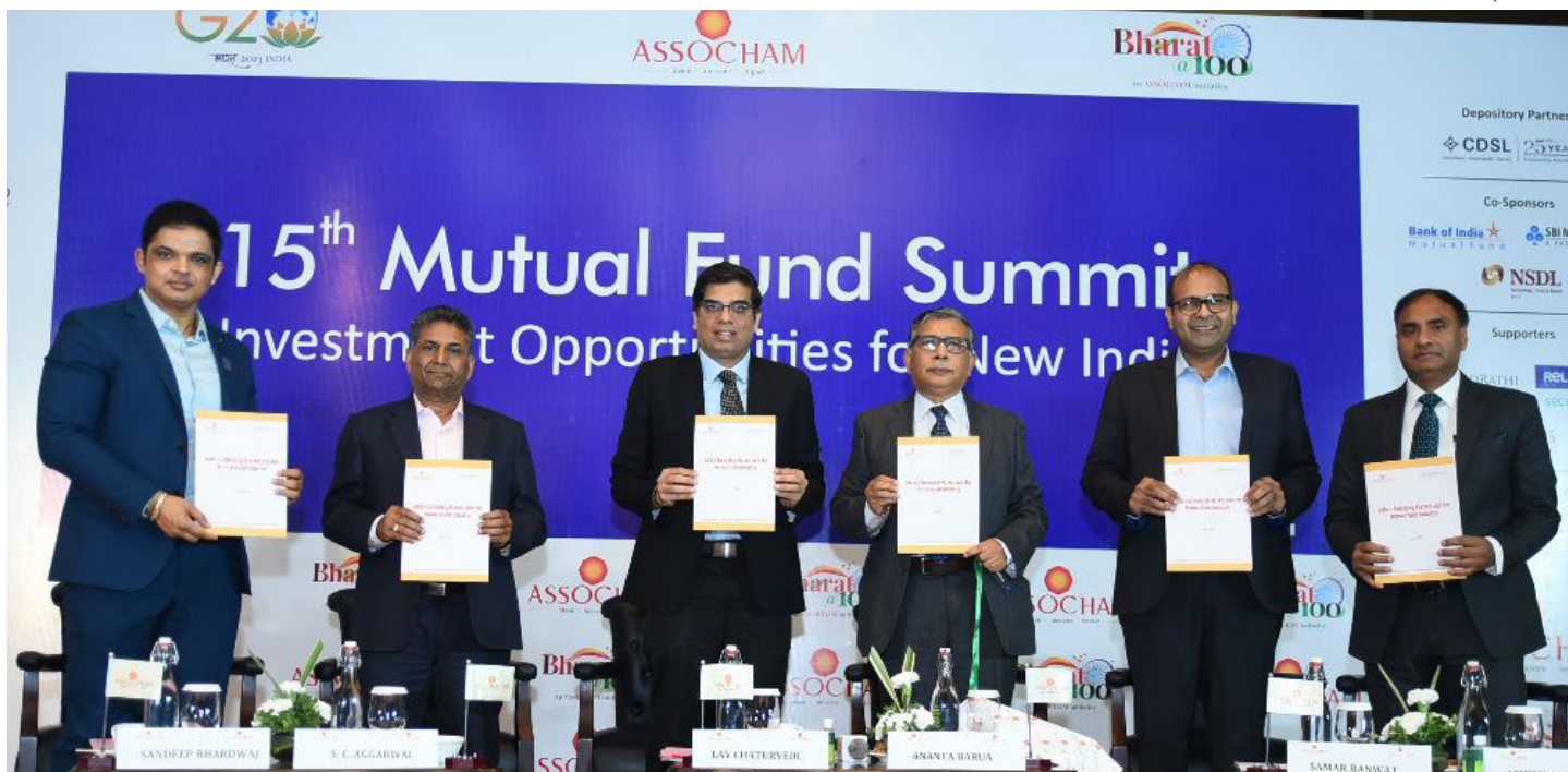
Knowledge report release on Investment opportunities for new India by eminent speakers

This move promotes competition and encourages the establishment of more mutual funds. Furthermore, SEBI has revised the requirements for sponsoring a mutual fund, enabling entities with sound financial conditions, including private equity funds, to become sponsors without a mandatory profit track record.”