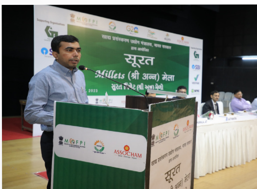
Surat Millets Mela