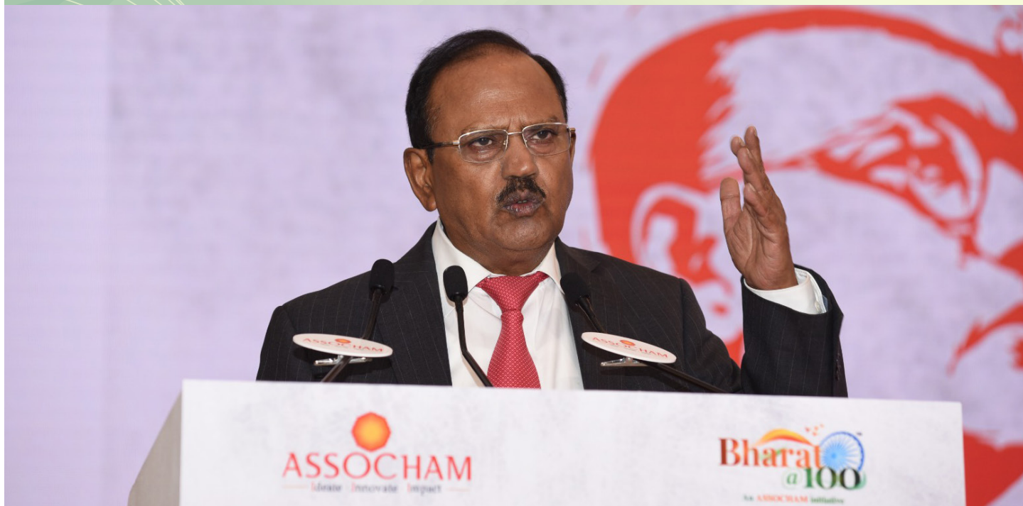
Ajit Doval, KC, National Security Advisor, Prime Minister's Office at ASSOCHAM Netaji Subhas Chandra Bose Memorial Lecture held in New Delhi

Netaji had great faith in the capabilities of the people. Today, our priority should be empowering our 1.4 billion citizens and making them internationally competitive," stated Shri Ajit Doval, KC, National Security Advisor, Prime Minister's Office, at the Netaji Subhas Chandra Bose Memorial Lecture organised by the Associated Chambers of Commerce & Industry of India (ASSOCHAM). He called for continuous improvement in all aspects of life, stating, "Wherever you are, whatever you are doing, do it better than yesterday." Shri Doval acknowledged India's