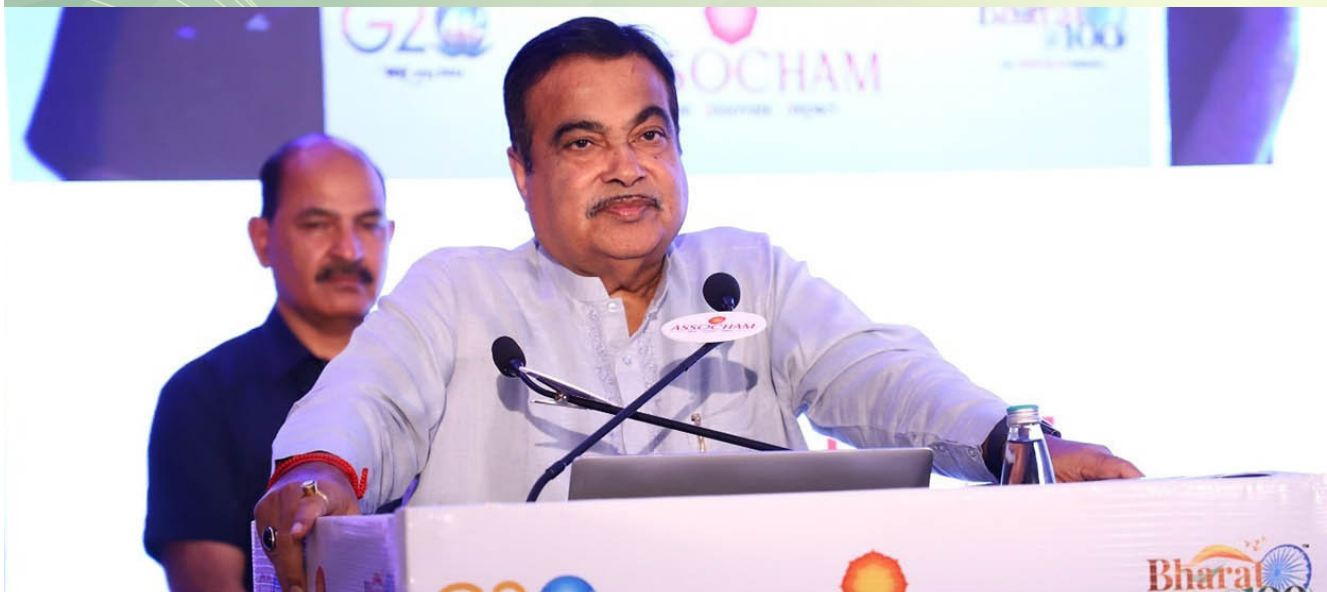
Nitin Gadkari Hon'ble Union Minister of Road Transport and Highways at ASSOCHAM Annual Flagship Infrastructure Conference Cum Awards

The infrastructure sector plays a key role in India's development, my congratulations to all the award winners for their excellent performance. We need to change perceptions and adapt to the circumstances and requirements. Understanding the financial and technical aspects holistically is the need of hour. The current environment where those working in the hydro sector are rejected in the road sector and those working in the road sector are rejected in the Railways sector needs to be remedied. Those with the capacity and experience to deliver quality work must be given the opportunity for better infrastructure said Shri Nitin Gadkari, Hon'ble Union Minister