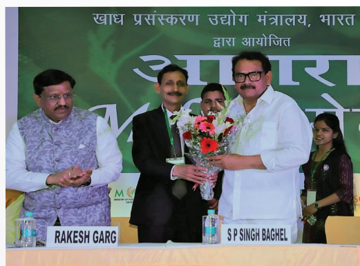
Agra Millets Mela