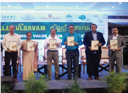
National Conference on Millet Ulsavam