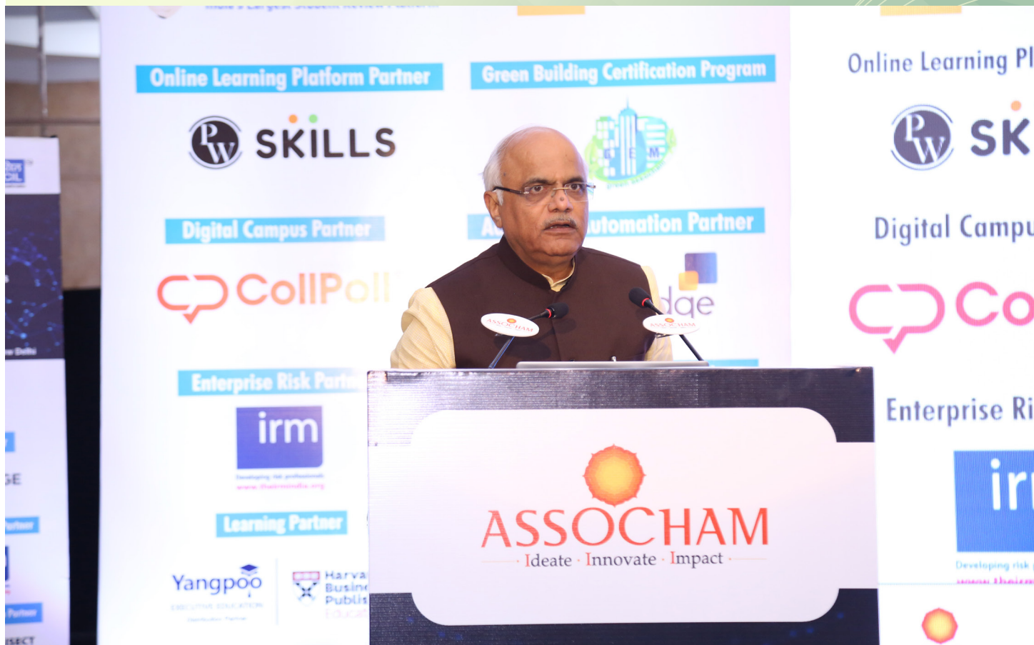
Dr. Vinay Sahasrabuddhe, President, Indian Council for Cultural Relations (ICCR) at the Education Summit held in New Delhi

At the ASSOCHAM 16th International Education Summit & Skill Development Summit 2023, Dr. Vinay Sahasrabuddhe, President of the Indian Council for Cultural Relations (ICCR), spoke as a guest of honor, and said that since education and skill development go hand in hand, private universities need to be quality-oriented in terms of studying values. It will result in individuals with the appropriate values and abilities for future youth.