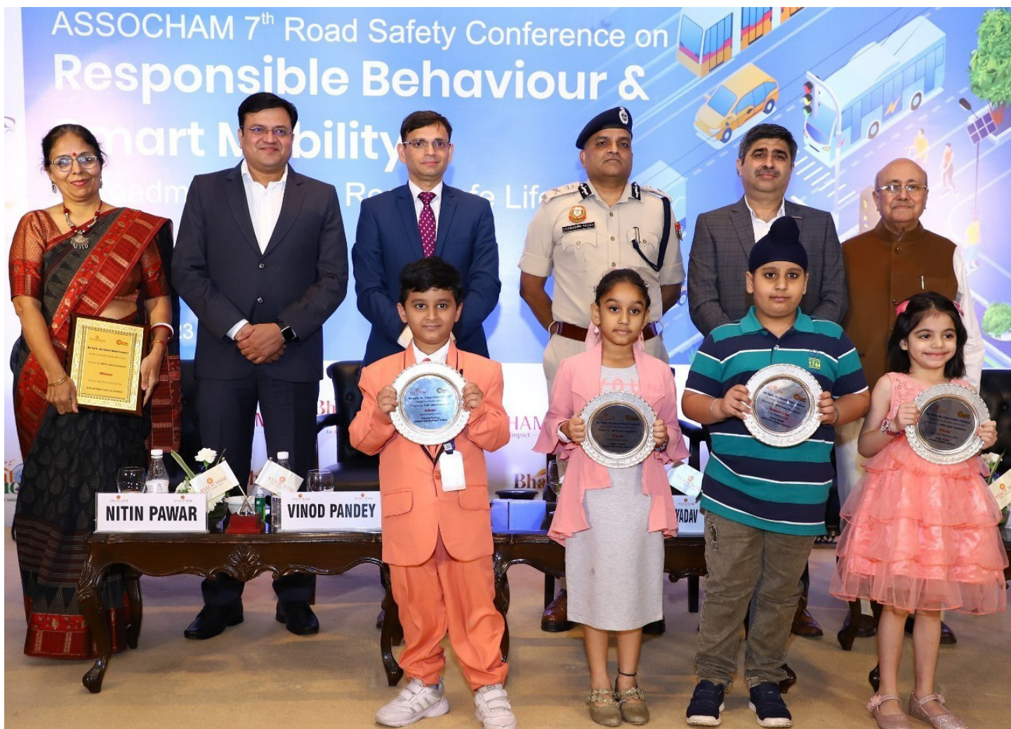
Felicitating Winners of BMW-ASSOCHAM Reel competition on road safety