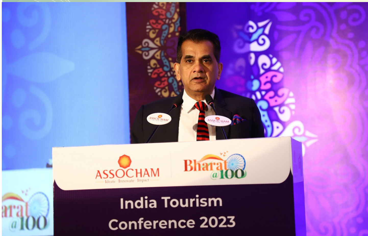
Amitabh Kant, G20 Sherpa, at the India Tourism Conference organised by ASSOCHAM.

Tourism will be a key driver of growth. India is the 5 th largest economy in the world and is expanding to be the 3 rd largest. Digital transformation has been one of the key drivers of India's economic growth. Every Indian has a digital identity, from 2015 to 2017 about 500 million bank accounts have been opened or 55% of all the bank accounts opened in the world. The seeding of these bank account with the digital identities has made the