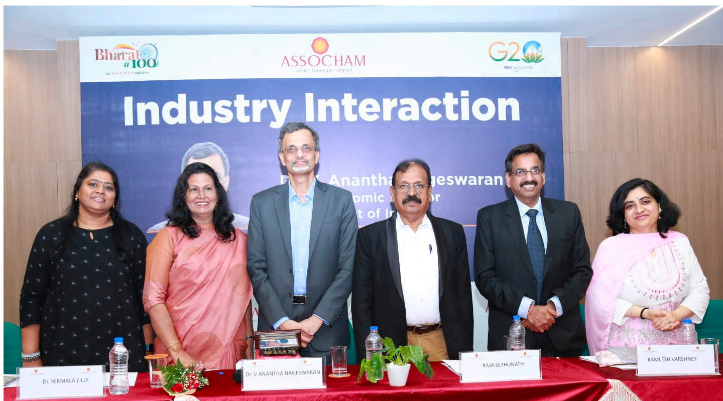
Dr. V Anantha Nageswaran, Chief Economic Advisor, shared insights on economy with eminent dignitaries in Cochin

are nearly 100,000 recognised startups in India, with over 43,000 led by women.” Between 2018 and 2022, the compounded growth rate of jobs created by startups was around 32%. Over 60% of the 326 incubators are located in non-metropolitan areas, with 70% in