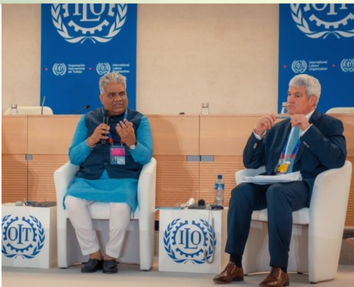
Bhupendra Yadav, Union Minister for Labour and Employment and Environment, Forest and Climate Change at ILO in Geneva