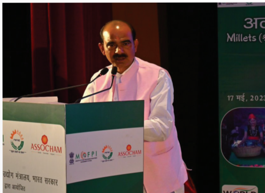
Ajay Tamta, MP Almora at ASSOCHAM Millets Mela